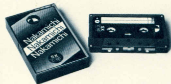
SX Cassette Tape C-60, C-90