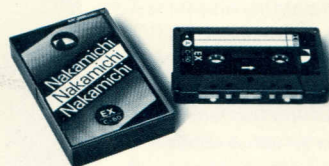
EX Cassette Tape C-60, C-90