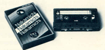
EXII Cassette Tape C-60, C-90

NAKAMICHI RESEARCH (U.S.A.), INC. 220 Westbury Avenue Carle Place, N.Y. 11514 Phone: (516) 333-5440 Telex: 144513 (NAKREI CAPL)