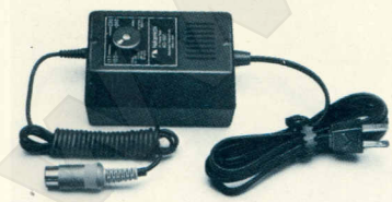
AD-551 AC Power Pack